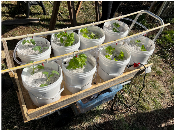
Figure 5. Dutch bucket system.

The Dutch bucket system (Fig. 5) was created using 2-gallon buckets filled with perlite and clay pellets as a medium to hold the crops. Tubing is suspended over the top of the buckets with nozzles to deliver the nutrient solution to the plants for fifteen minutes every two hours. The nutrient solution is circulated by a pump in the reservoir. Each bucket is fitted with a drain tube that allows water to drain using gravity and flow back into the water reservoir. Initially, small grains of perlite clogged some of the drains causing the system to overflow or have decreased circulation. This issue was remediated by installing screens in front of the bucket drains to prohibit perlite from leaving the buckets and clogging the drain tubes.