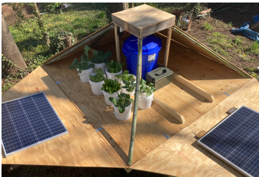
Figure 4. Prototype floating platform, partially folded.