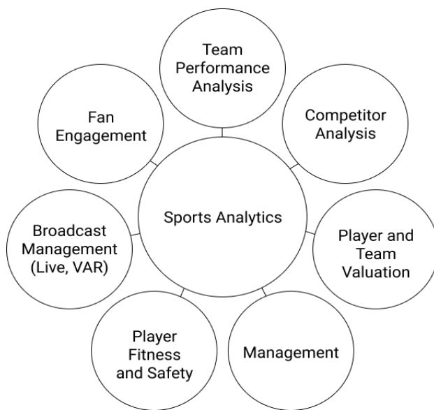
Figure 1: Segments of the Sports Analytics Industry as defined by a report produced by Markets and Markets [1]

While the sports analytics industry is growing, few professional and collegiate teams share their findings to retain a competitive edge. There are organizations like the Gatorade Sports Science Institute, MIT Sloan Sports Analytics Conference, and Sports Analytics Club Program that are attempting to build upon existing research and share information, but do so with little success because of the limited community participation or research questions they are attempting to answer [4], [5], [6]. Many organizations narrowly focus on exercise science, optimization of in-game decision making, and other competition or health-focused research. This leaves many opportunities to apply the same analytics research to sports marketing, business performance, sports compliance fields and other segments of the industry shown in Figure 1. Currently, the field of sports analytics is left in a segmented and incoherent state due to the limited sharing and research in small communities. We propose an open, interdisciplinary approach to creating a sports analytics center within institutes of higher education that provides opportunities to serve society, cultivate vibrant communities, enable research and communication across fields, strengthen various aspects of the institution’s foundation, and collect and use data ethically.