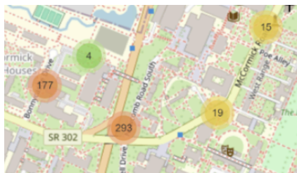
Figure 1. Cluster Map of Harsh Cornering Events from 2019 to 2024

Using the provided coordinates for each surrogate measure event and FM vehicle crash, we were able to generate maps via Python and C# programs. Python scripts extracted surrogate measure data from GeoTab for each FM vehicle, storing them in individual log files by vehicle. A C# program then mapped these events onto cluster maps, grouping them by proximity and highlighting density with color coding: green for low, yellow for medium, and red for high event area. This approach allowed for easy identification of areas with higher events densities, as depicted in Figure 1. This provided the initial information needed to identify safety hotspots. FM vehicle crash data was similarly mapped for comparison.