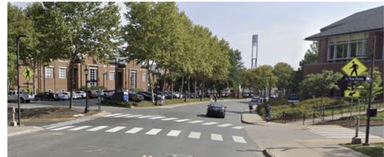
Figure 5. Picture of the Alderman at AFC Zone

Alderman Rd (AFC): This location is prone to violations of harsh braking and cornering associated with its multiple sharp turns. The widening of roads around these turns can reduce harsh cornering events. The current pedestrian crossing set up with two parallel pedestrian crossings in proximity, with only one of them having pedestrian crossing lights, as seen in Figure 5, contributes to the harsh braking, based on student experience. Simplifying this into a single, well-signaled crosswalk could enhance both driver and pedestrian safety.