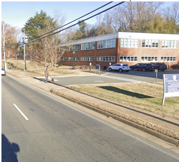
Figure 3. Picture of Emmet St. N (Carruthers Hall)

Emmet St N (Carruthers Hall): We noticed that the turn into Carruthers Hall comes without a warning and is positioned awkwardly just before a stoplight, as seen in Figure 3. With a speed limit of 40 mph, FM drivers often corner harshly to navigate the turn (1841 events). To counter this, we propose the addition of a right turn lane into Carruthers Hall, which, according to past studies, can reduce crash occurrences by 30% at similar intersections [15]. We believe this implementation would significantly decrease both the number of harsh cornering events and the risk of crashes in this zone.