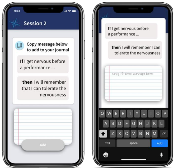
Fig. 3. Implementation intentions journal feature

training if the scenarios were not relevant or applicable. These are important considerations for future work.