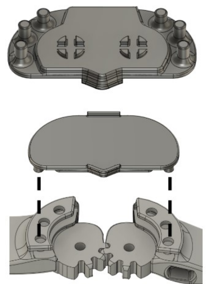
Figure 1. At the top we see the underside of the hinge cap that is then flipped over and guided into the gear housing which allows for complete inhibition of

An initial complete inhibition of movement is necessary at the knee joint immediately following invasive surgeries. Within the modifications that the team designed, the addition of a mechanism that could completely lock the user out of flexion or extension at the knee joint was necessary to achieve the previously mentioned need. To accomplish this, a hinge cap was created that could lock a user's knee in the appropriate position following their operation. The brace pivots around the central brace located at the knee. The hinge cap acts as a deadbolt on this hinge, completely inhibiting movement by inserting pins into the main hinge gear housing.