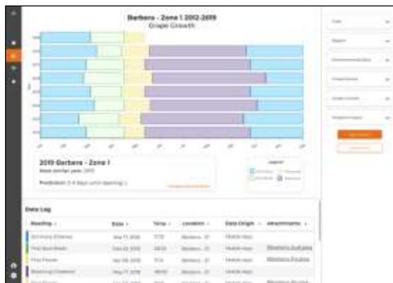
Fig. 4. Desktop – Grape Growth Cycle History

In Fig. 4, the user sees an overview of important milestones in a grape’s growth cycle for four years. This is linked to historical summary reports of sensor data to help users understand how weather variability affects grape growth year-to-year. For example, a user could identify bud break occurs earlier in warmer years, informing them that their grape will be exposed to pests, disease, and frost earlier in the year. A holistic, high-level understanding of this data will enhance strategic, year-to-year management of a vineyard.