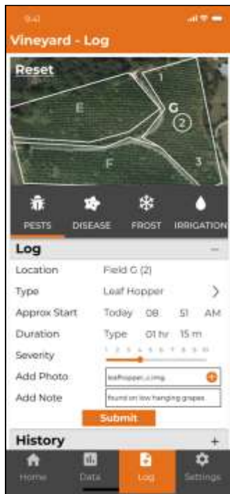
Fig. 3. Mobile - Pest Threat Log

The presentation of historical data, optimized for a desktop UI, allows year-to-year comparisons of weather and grape growth. This data is accessed less frequently than data related to routine active management decisions and not while in the field. A sample is shown in Fig. 4.