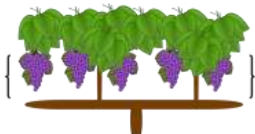
Fig. 1. Vine sketch (with fruiting zone emphasis added)

information than others. Specifically, each vine has a fruiting zone (Fig. 1) where grapes grow. Temperature, humidity, and light conditions in the fruiting zone directly impact the development of the fruit.