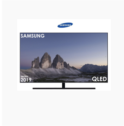
Samsung TV $600.0