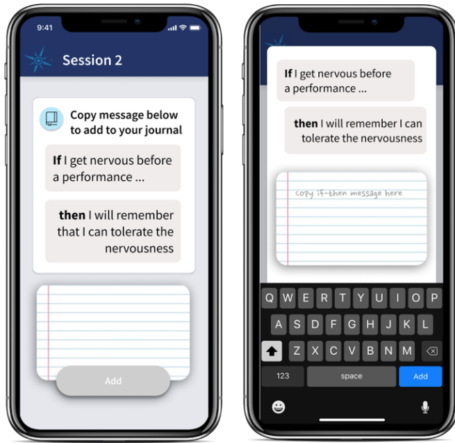
Fig. 3. Implementation intentions journal feature

training if the scenarios were not relevant or applicable. These are important considerations for future work.