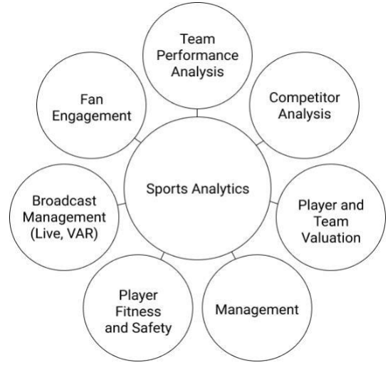
Fig. 1. Segments of the Sports Analytics Industry as defined by a report produced by Markets and Markets [1].

While the sports analytics industry is growing, few professional and collegiate teams share their findings to retain a competitive edge. There are organizations like the Gatorade Sports Science Institute, MIT Sloan Sports Analytics Conference, and Sports Analytics Club Program that are attempting to build upon existing research and share information, but do so with little success because of the limited community participation or research questions they are attempting to answer [4], [5], [6]. Many organizations narrowly focus on exercise science, optimization of in-game decision making, and other competition or health-focused research. This leaves many opportunities to apply the same analytics research to sports marketing, business performance, sports compliance fields and other segments of the industry shown in Figure 1. Currently, the field of sports analytics is left in a segmented and incoherent state due to the limited sharing and research in small communities. We propose an open, interdisciplinary approach to creating a sports analytics center within institutes of higher education that provides opportunities to serve society, cultivate vibrant communities, enable research and communication across fields, strengthen various aspects of the institution's foundation, and collect and use data ethically.