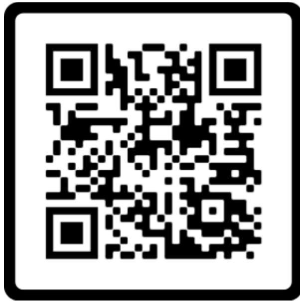
Figure 17: QR Code for our Expo app