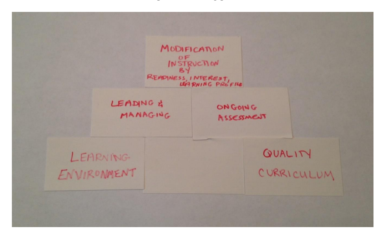
Figure 4. Nicole's second concept map illustrating relationships among the five elements of a differentiated classroom. Created during Phase 2 Interview 2 on October 20, 2014.

around two months, she repeated the concept map activity she had completed during our final Phase 1 interview in May. I asked her to create a representation of the relationships among the five elements of a differentiated classroom (see Figure 4) and to think aloud as she created it. In Phase 1, Nicole had created a concept map in which learning environment and leading students and managing routines formed a box encompassing the ongoing cycle of curriculum, assessment, and instruction (see Figure 3). She had characterized learning environment as slightly more important than the other four elements, using a building metaphor to describe learning environment as the first layer of foundation and leading students and managing routines as the second foundational layer (interview, 5/01/14). Within the cycle of curriculum, assessment, and instruction, she described curriculum as the most important starting point (interview, 5/01/14).