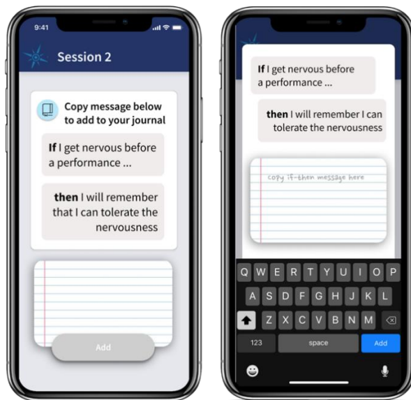
Fig. 3. Implementation intentions journal feature

The Challenger app [14] also provides examples of personalization that could be potentially beneficial for MindTrails. Future work could test making scenarios more specific by having users input the names of, relationships to, and level of comfort with individuals in their lives, such as friends and family members. For example, a scenario could then read, "You are co-hosting a dinner party with your friend Angie ." Location tracking could be added to the mobile application so that scenarios can be presented when a user needs them. A scenario and associated implementation intention about giving a presentation at work could be presented when the location tracker notes that the user is in their office building, for example. One additional consideration would be to personalize push notifications from the mobile app so that users get individualized reminders to complete the intervention at times that are best for them. All of these